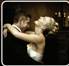
First Dance Lessons