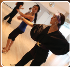
Private Beginners Lessons

Experience the studio now with a complimentary 25 min private dance lesson. Call 0845 567 1155